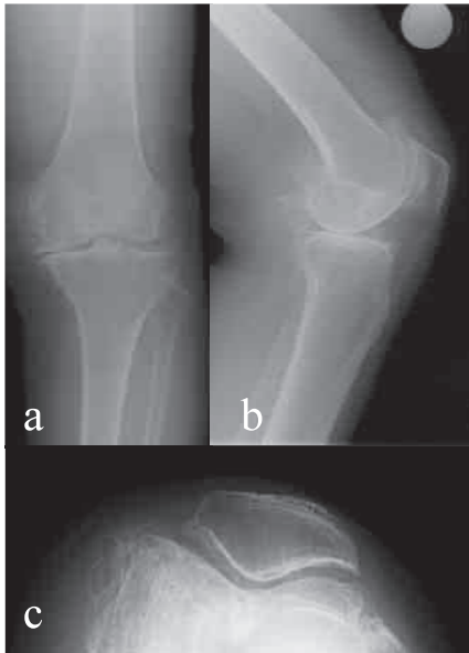
Figure 1 : Preoperative radiographs showing advanced degenerative arthritis of the left knee. (a) Anteroposterior view, (b) lateral view, and (c) skyline view.

of the left knee. Physical examination revealed a decreased range of motion from 20^{\circ} to 100^{\circ} , and preoperative radiographs showed advanced degenerative arthritis of the left knee (Figure 1a-c). The preoperative femorotibial angle was 181^{\circ} . The patient had undergone posterior stabilized TKA (Scorpio NRG ; Stryker, Mahwah, NJ). Exposure was obtained through a medial parapatellar approach and the patella was resurfaced with 8 mm-thick polyethylene. Optimal patellar tracking was confirmed by the surgeon after implantation using the 'no thumb test', which confirm the patellar tracking without holding the patella using surgeon's thumb. Lateral release was not performed in this surgery. The intraoperative range of motion improved from 20-100^{\circ} to 5-125^{\circ} .