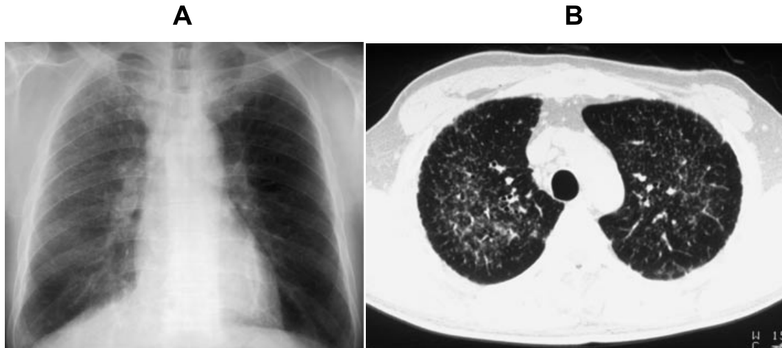
Figure 1. (A) A chest X-ray film on admission (March 16, 2001). Bilateral hilar lymphadenopathy and diffuse small nodular shadows in the bilateral lung fields were observed. (B) A Chest high resolution CT film on admission (March 19, 2001). Diffuse small nodular opacities oriented mainly in a centrilobular and peribronchovascular pattern and pleural nodules were seen.