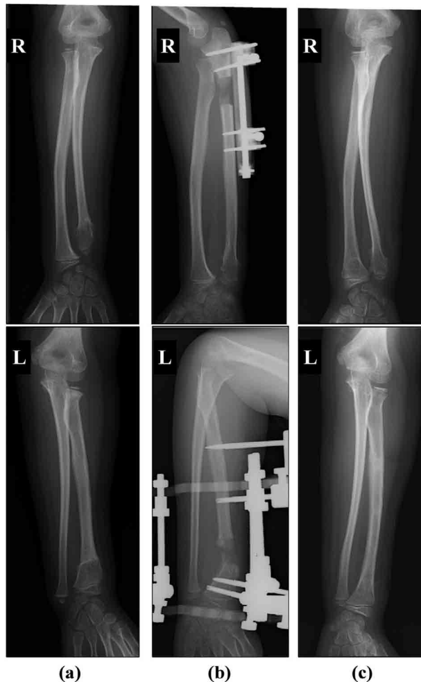
Fig. 2. Case 2 : (a) Radiographs of the forearms of an 8-year-old girl, showing hypoplastic left distal radius and right distal ulna with large distal exostoses, before osteotomy. (b) Radiographs showing distraction osteogenesis of the right ulna with Orthofix and the left radius with Ilizarov frame immediately after the completion of the lengthening. (c) At 358 days after osteotomy, radiographs showed no radial head subluxation and the angular deformity of the right radius was corrected.

At 358 days after osteotomy, the left ulna and right radius showed appropriate length with improved appearance (Fig. 2c) and function in the wrists. Radial deviation was 25° bilaterally and ulnar deviation was 50° bilaterally, but a pin site keloid remained in the left forearm due to a superficial pin site infection.