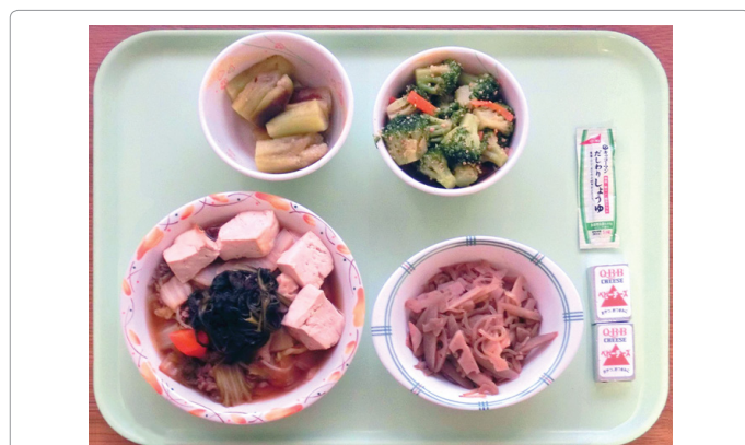
In this meal, the kinds of foodstuff and carbohydrate dose are as follows: • Japanese style Sukiyaki with beef, tofu, egg, jelly, onion, mushroom, edible chrysanthemum, Japanese leek, other vegetable and sukiyaki soup 12 g, • lotus root and jelly 6.7 g, • 2 pieces of process cheese 0.4 g • eggplant 3.6 g, • broccoli and carrot with sesame 3 g, • soy sauce (5 g) 0.3 g • Sum total from a) to f) is 26 g of carbohydrate of this meal.

Current study revealed that the case showed remarkable decrease of