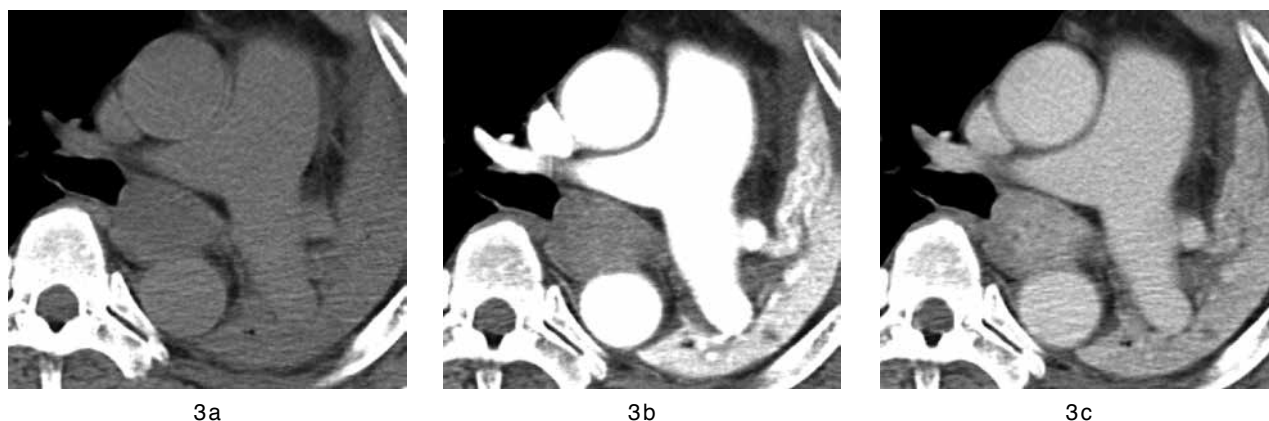
Fig 3. Multiphasic contrast-enhanced computed tomography (CT) images of a 60-year-old man with adenoid cystic carcinoma. (a–c) The tumor appears as a 38-mm-long smooth mass occupying the left main bronchus and showing gradual enhancement on multiphasic contrast-enhanced CT images.