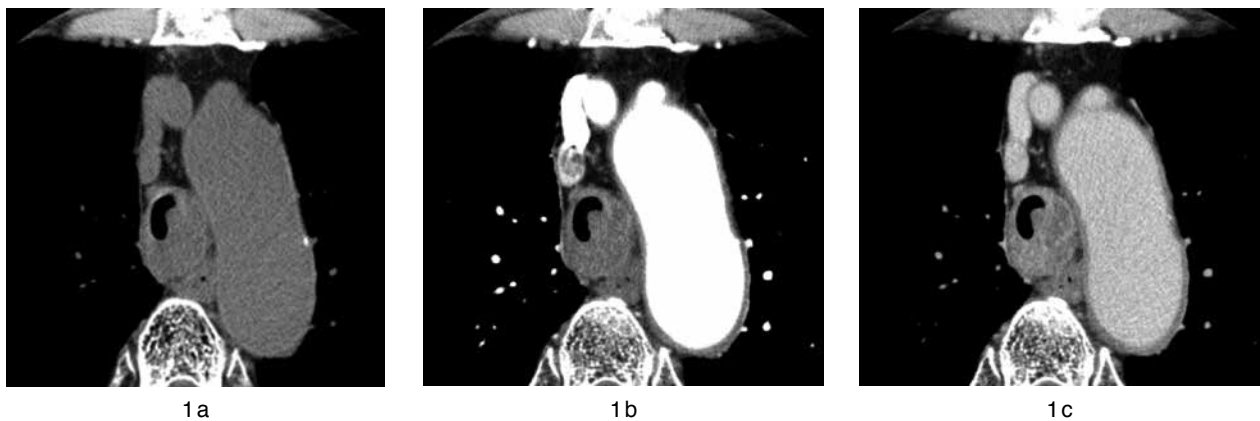
Fig 1. Multiphase contrast-enhanced computed tomography (CT) images of an 80-year-old man with adenoid cystic carcinoma. (a-c) The tumor appears as a sub-circumferential wall thickening mainly of the left tracheal wall, showing gradual enhancement on multiphase contrast-enhanced CT images.

analysis was normal. Chest X-ray showed total obstruction atelectasis of the left lung. Subsequent multiphase contrast-enhanced CT revealed a 3.8-cm long smooth mass occupying the left main bronchus with consecutive obstruction atelectasis of the left lung. The mass displayed a relatively homogenous contrast enhancement, with gradual enhancement in the dynamic study (Fig. 3 a-c). The mean attenuation value within each ROI was 81 HU on the unenhanced, 120 HU on the early-phase, and 155 HU on the late-phase images. The A_L - A_U was 74 HU. Bronchoscopy revealed a smooth mass with left main bronchus obliteration. Biopsy was not performed because the tumor was reddish, and vasodilatation was observed on its surface; thus, we considered there was a high risk of bleeding. As malignancy was suspected, left pneumonectomy was performed. The histopathological analysis revealed a submucosal tumor spreading throughout the entire bronchial circumference and the tumor cells showed a cribriform pattern. The patient was diagnosed with ACC. Because R1-resection was determined at the proximal bronchial stump, radiotherapy (66 Gy in 33 fractions) was applied additionally. Tumor recurrence has not been observed 7 years after the diagnosis.