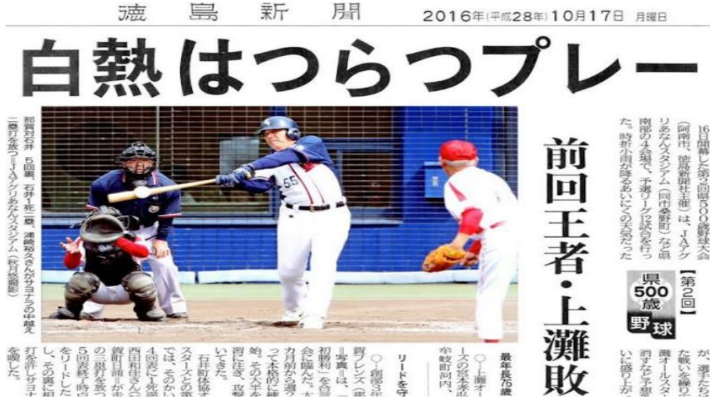
Figure 2: Social and sports history of the case He hit gave his team a walk-off victory in masters' baseball tournament.

mg/dL, LDL-C 142 mg/dL, TP 7.3 g/dL, Alb 4.3 g/dL, AST 22 U/L, ALT 28 U/L, GGT 25 U/L, ALP 193 U/L (100-340), LDH 141 U/L (120-240), CRP 0.02 mg/dL, Concerning diabetes, HbA1c 14.0%, post-prandial blood glucose 292 mg/dL. Other examinations were as follows: Chest X-P was unremarkable, and electrocardiogram (ECG) revealed within normal limits.