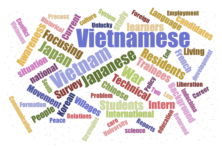
Figure 3. Word Cloud generated by the first title for each year picked from the search for "betonamujin"