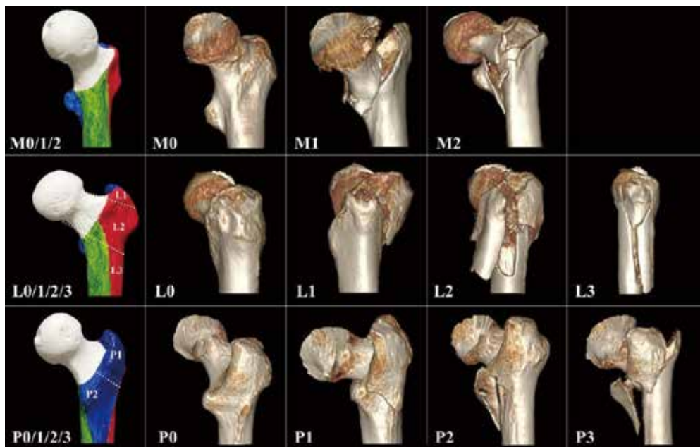
Figure 2. Actual images of three-dimensional computed tomography (3D-CT) in each subtype. A intertrochanteric fracture is characterized as M_{0/1/2}L_{0/1/2/3}P_{0/1/2/3} . M, medial column (Green area) ; M_0 , intact wall ; M_1 , simple fracture ; M_2 , multifragmentary fracture. L, lateral column (Red area) ; L_0 , intact wall ; L_1 , proximal portion fracture ; L_2 , intermediate portion fracture ; L_3 , distal portion fracture. P, posterior column (Blue area) ; P_0 , intact wall ; P_1 , GT fracture ; P_2 , LT fracture ; P_3 , GT + LT fracture.