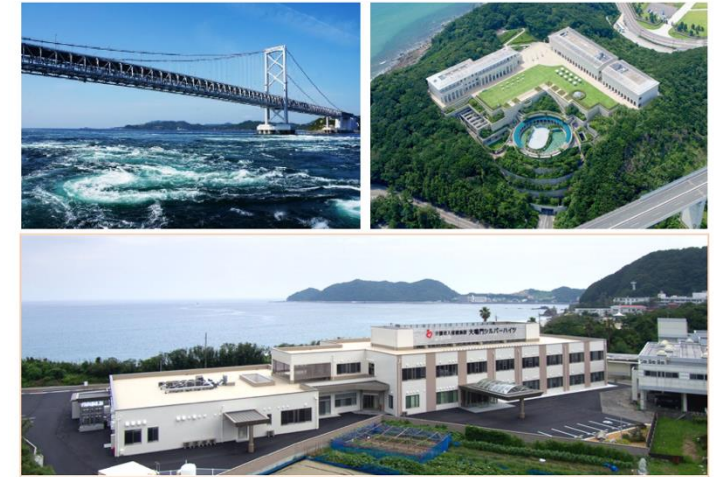
Figure 3: Tokushima prefecture has Naruto city with 3 famous related facilities.