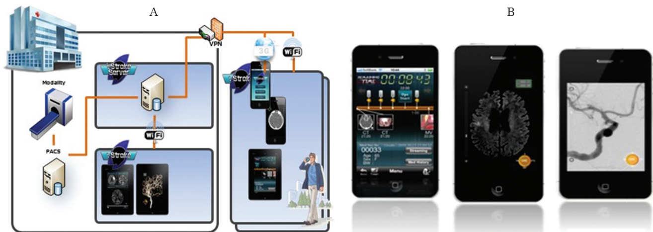
Fig. 1 (A) Components of the system (SYNAPSE Erm) for connecting off- and on-site medical care providers. (B) Display of the diagnostic and treatment data on mobile devices.

Between February 2013 and December 2015, we used the TSS in 321 emergencies (acute stroke in 161 (50%), head injury in 51 (16%), gastrointestinal